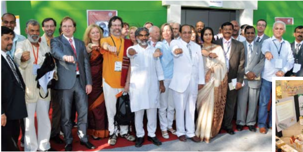
International participants pledging for the cause of Ayurveda