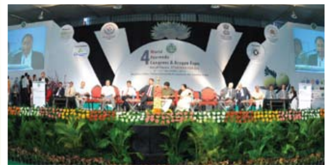
Inaugural speeches in progress