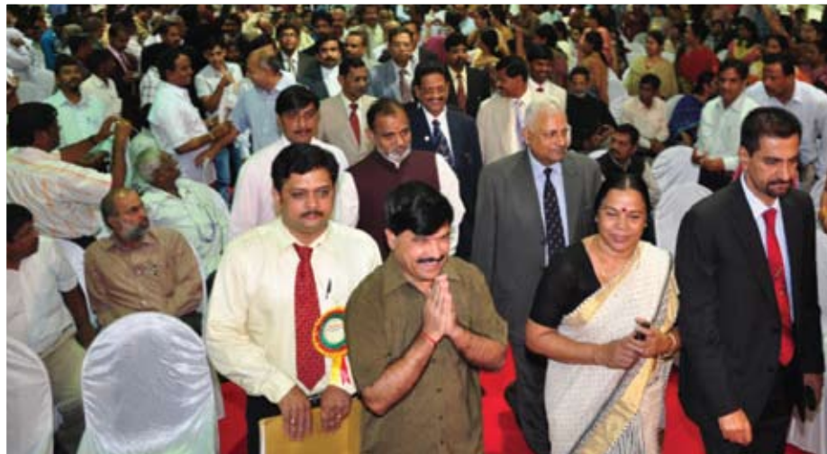
A Glimpse of the audience