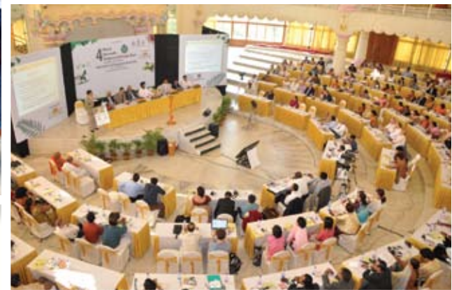
International Delegates' Assembly